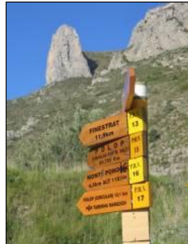
signs at start

Now you head to the far end of this col and make for a scree trail on the steep