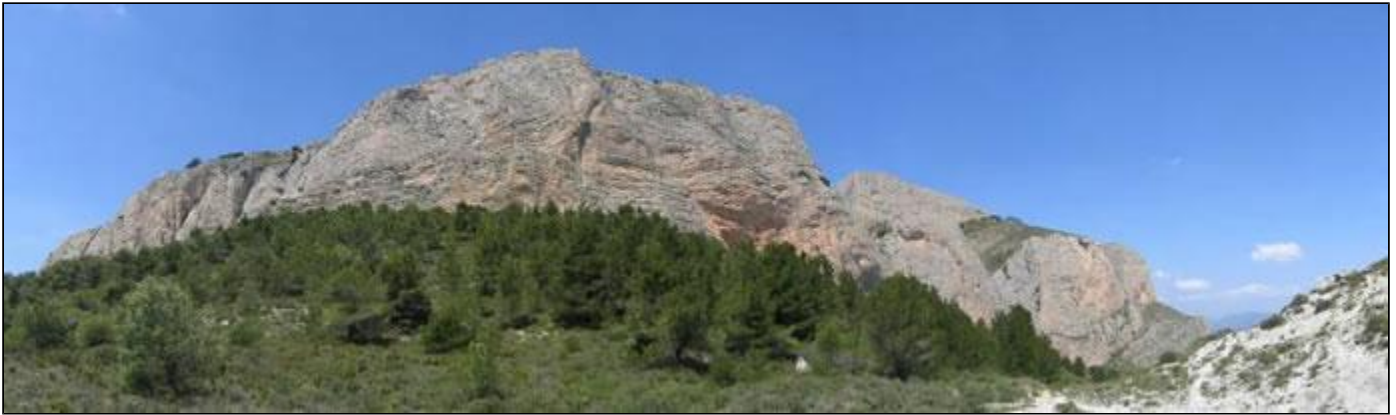
Sanchet South face - the route approaches the summit via the green shoulder on the right

Approach: Similar to that of the Sanchet Circuit - heading to the coast on the CV70 from Guadalest the road drops steeply. Towards the bottom of the hill there is a wide cutting with stone walls on either side. Turn right immediately at the end of the stone walls and follow the surfaced track up to its end and in all but wet weather continue along the unsurfaced track until it is possible to park next to a farm building down to the left of the track 3.5 kms from the main road. If you come to the brightly painted house you have gone too far.