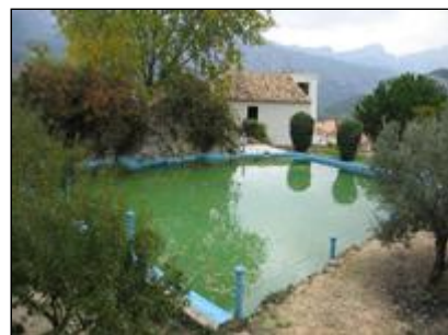
Mill pond at Confrides