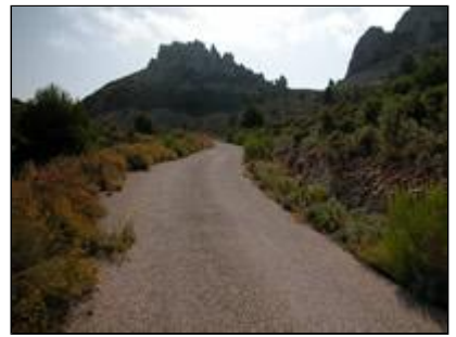
Approaching Confrides Castle

This is a delightful circuit on almost traffic free lanes. It is very easy to follow and ideal for young children, or even for pushchairs. It can also be done as an extension to the first two walks, the Old Mill or the Old Terraces walks. If driving to the walk the best place to park is just past the house called Font Freda. Follow the road in an anti-clockwise direction. The road takes you past the small farm buildings of La Kabila, with it's collection of hens, ducks, geese and goats, and after further ascent brings you out onto a more level section with super views of the Castle on it's rocky peak (see castle walk ). At the last bend before the castle you can make a detour to the castle and/or extend the walk by doing the Confrides Castle East Circuit . If continuing on the West Circuit then once past the castle the road gradually descends around some big bends. At the next junction take the left turn which will return you to your starting point.