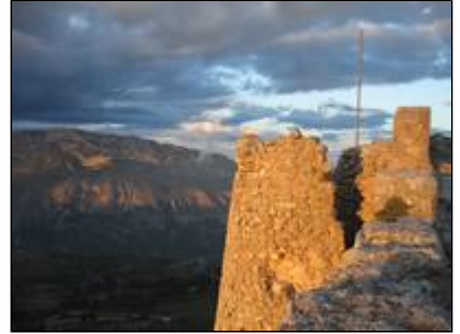
Castle at sunset