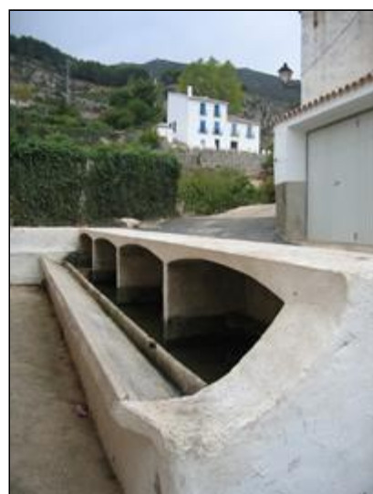
Lavadero in Confrides