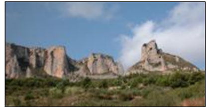
Castle and cliffs on Eastern Circuit