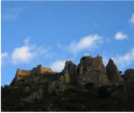
The Castle at sunset