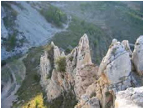
Looking back to the approach path

For the short walk the best parking space is just near the col on the road below the castle. From Abdet drive to the Eagles Nest Restaurant, this is signposted near Confrides. Continue past the Restaurant and drive around several hairpins until the Castle comes into view. Drive until you see a small parking area on the left side of the road. The castle is now directly above you.